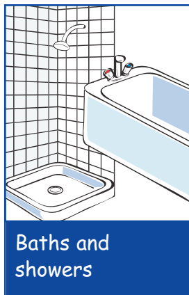
Baths and showers

4 Once surface is dry, remove safety signs.